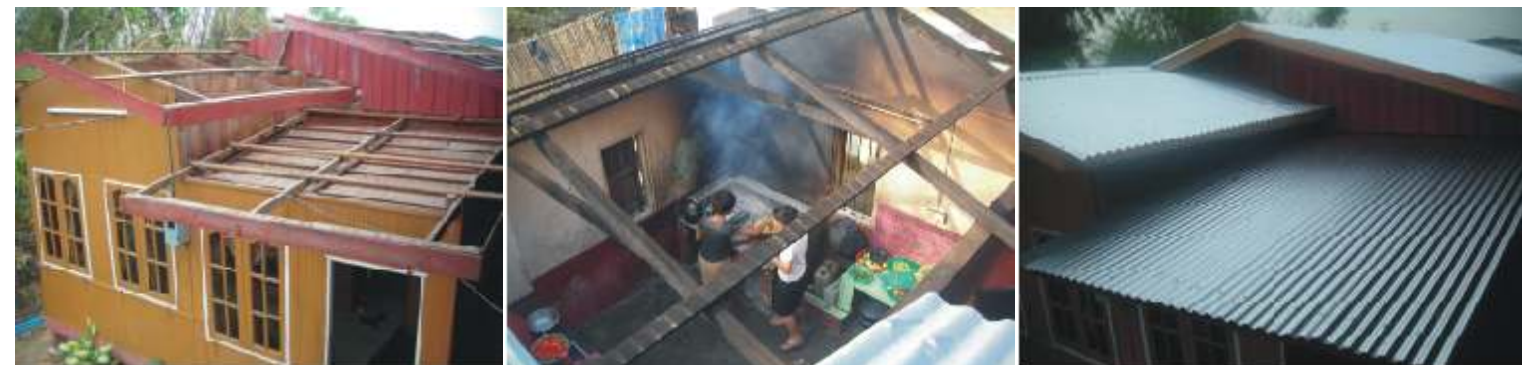
All of our Children's Homes lost their roofs. This is the Justina Home. We were able to repair the roofs on all our homes thanks to the response from our generous donors